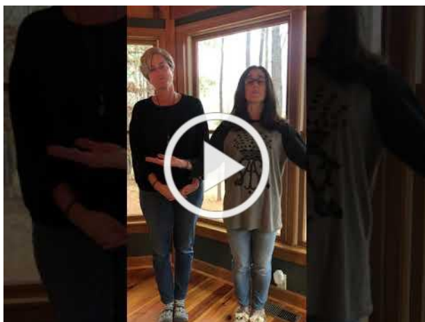
Help for Haiti

Every little bit is helpful to provide a home for a family in Haiti! Thank you to all who have already donated!