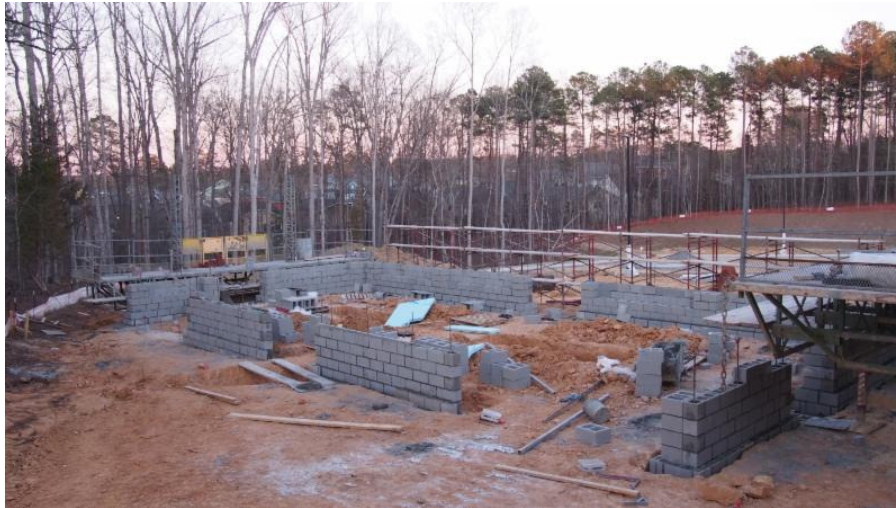
Foundation Work for Columbarium

Ashlynn and Ainsley Coulmas pose for a picture with the Celtic Cross which will soon be placed on the dome of our church. We brought the Cross to the Masses last weekend.