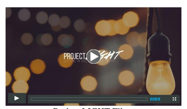
Project LIGHT Films

Be Part of the Movement and Donate Today!