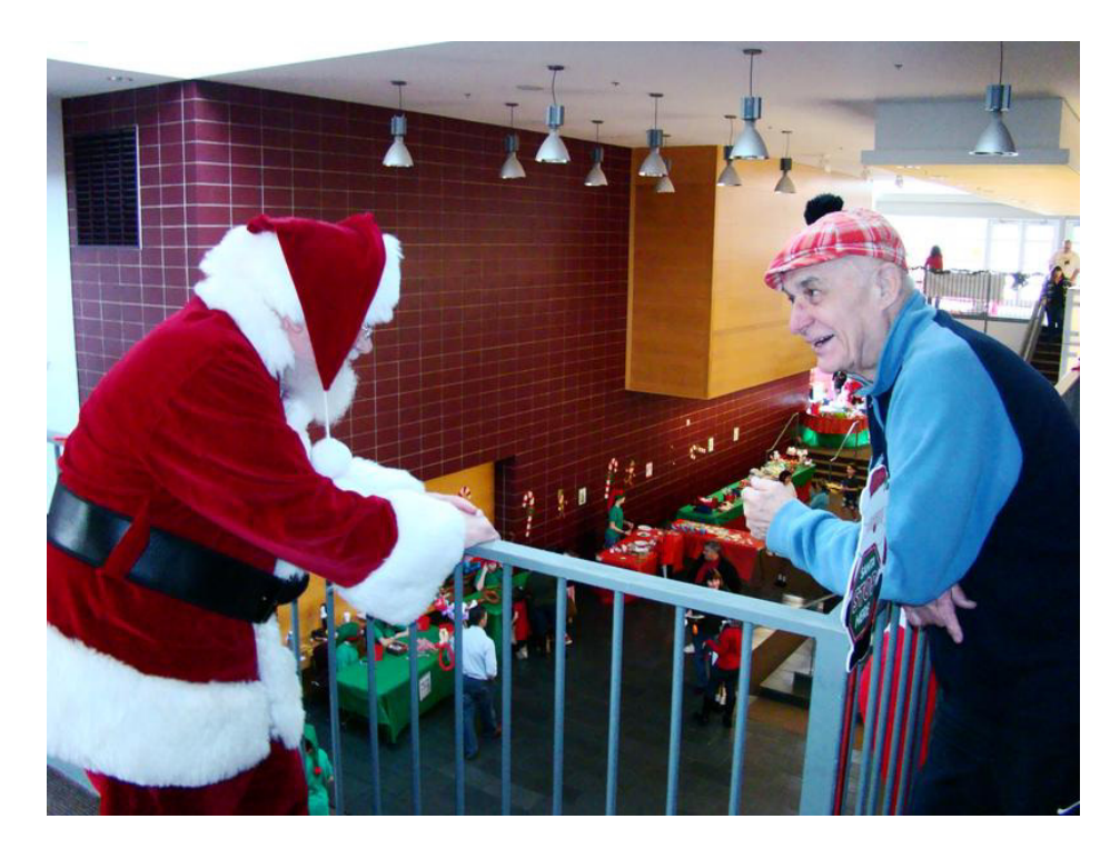
Pastor asks Santa for a new church!