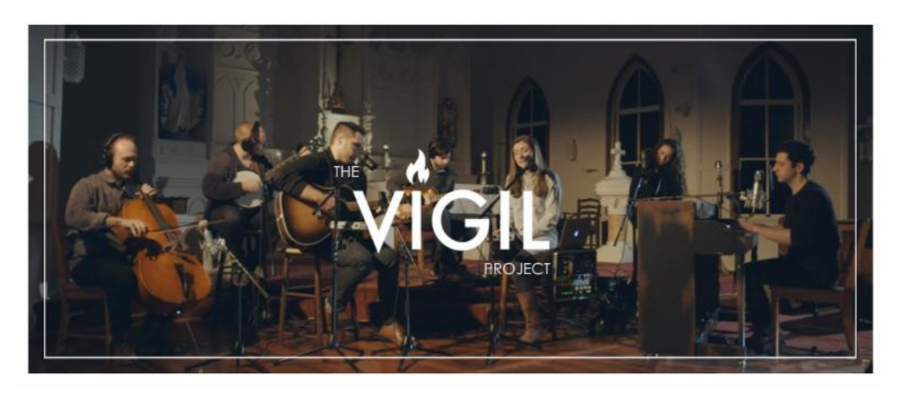
Prayer and Music like never before!

Join us as The Vigil Project comes to Apex, NC to share deep prayer and an authentic encounter with God all produced by a community of artists, musicians, and filmmakers.