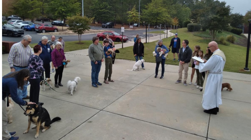
Blessing of the Animals October 2nd