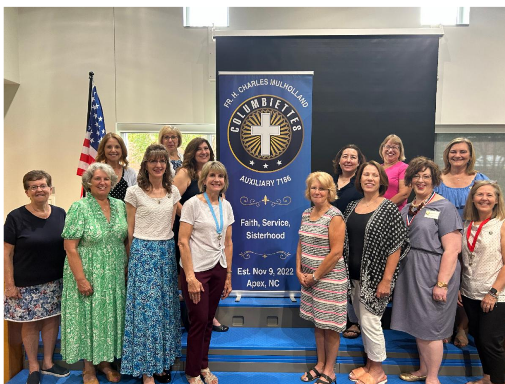
The Mulholland Columbiettes just grew by 8 more members to a family of 80+ women from StMM, St Andrew,