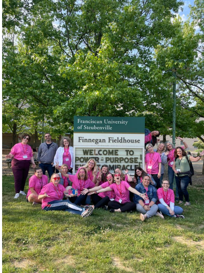
Power and Purpose Conference at Franciscan University