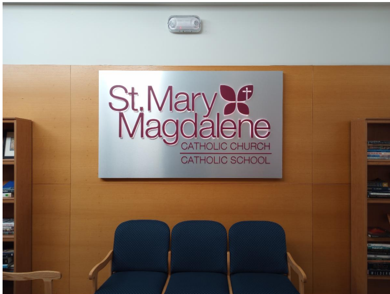
New sign installed this week