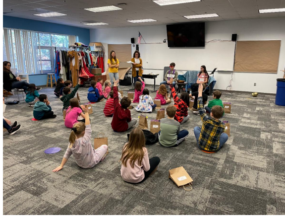
First Reconciliation Retreat 2/4/23