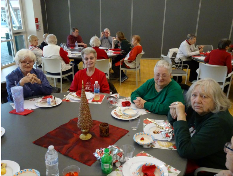
Catholic Seniors Organization's Christmas Party