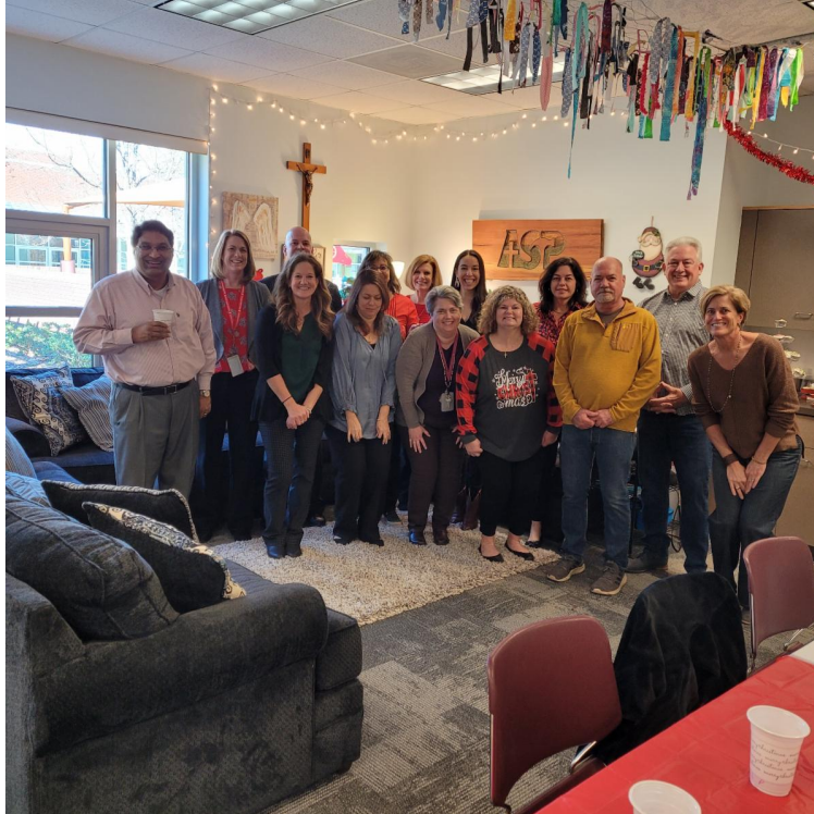
Parish Staff enjoying our Christmas potluck