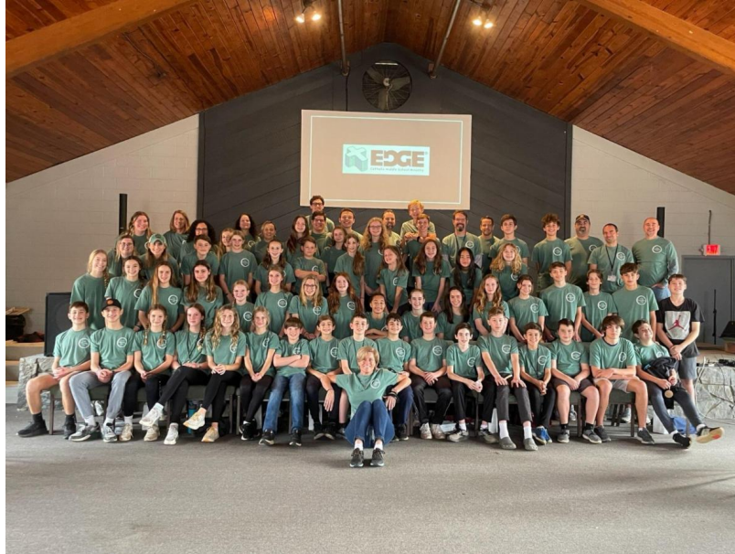
EDGE Retreat December 10th-11th