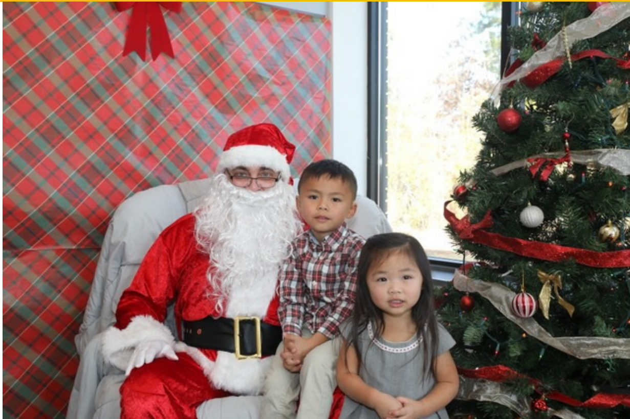
The Youth Ministry Teens were able to raise almost $700 for House in Haiti with photos with Santa.