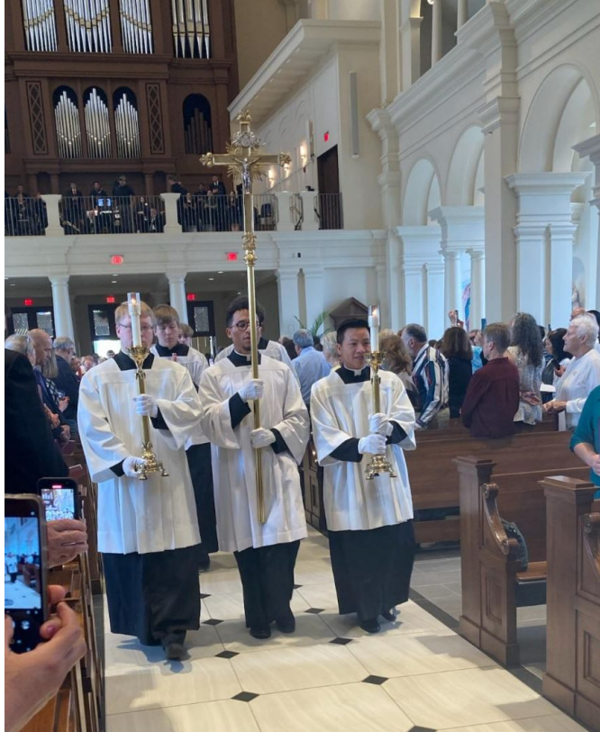
Chrism Mass at Holy Name of Jesus Cathedral