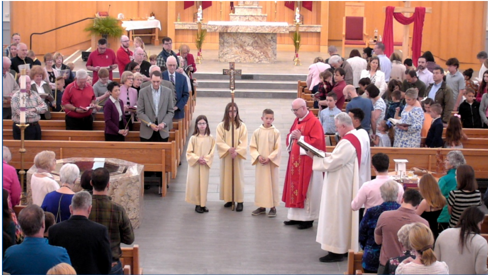
Palm Sunday Mass