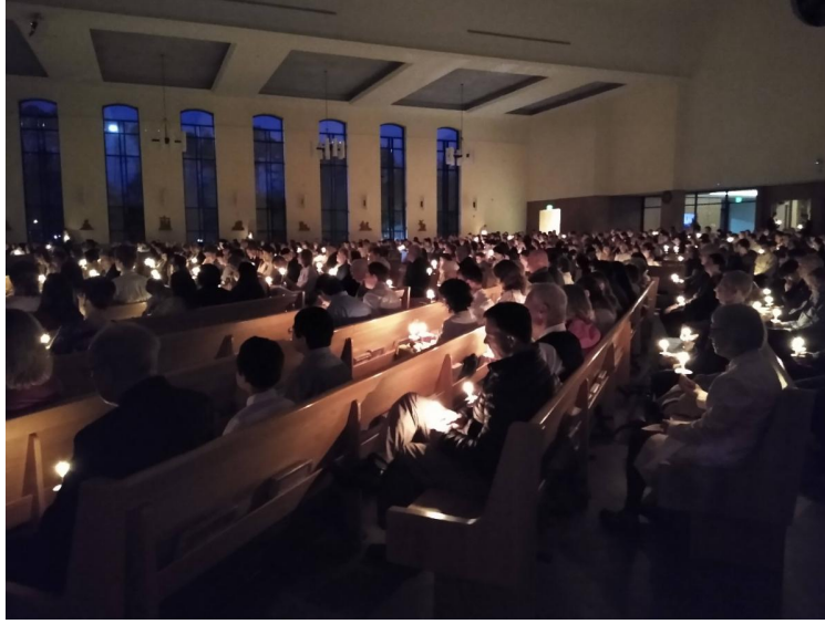
Easter Vigil Mass