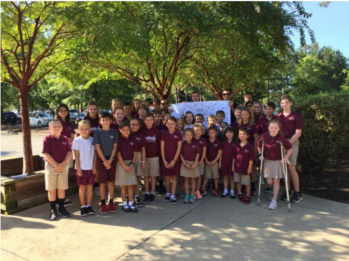
StMM School Children had a tribute for the Apex Police and Fire Departments. Afterwards, they had a moment of silence for the victims of September 11th.