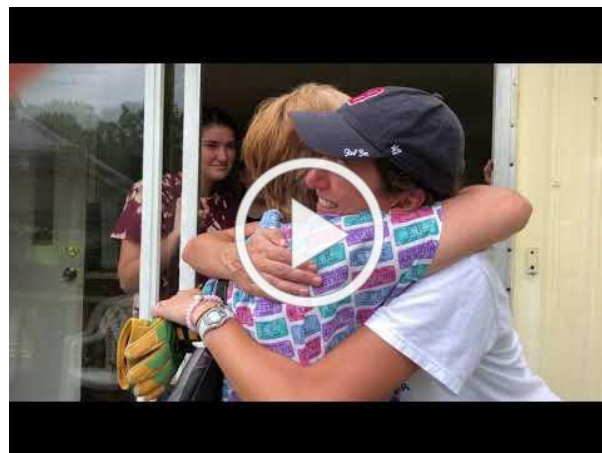
STMM ASP 2018