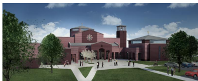
Visit Our Church Website