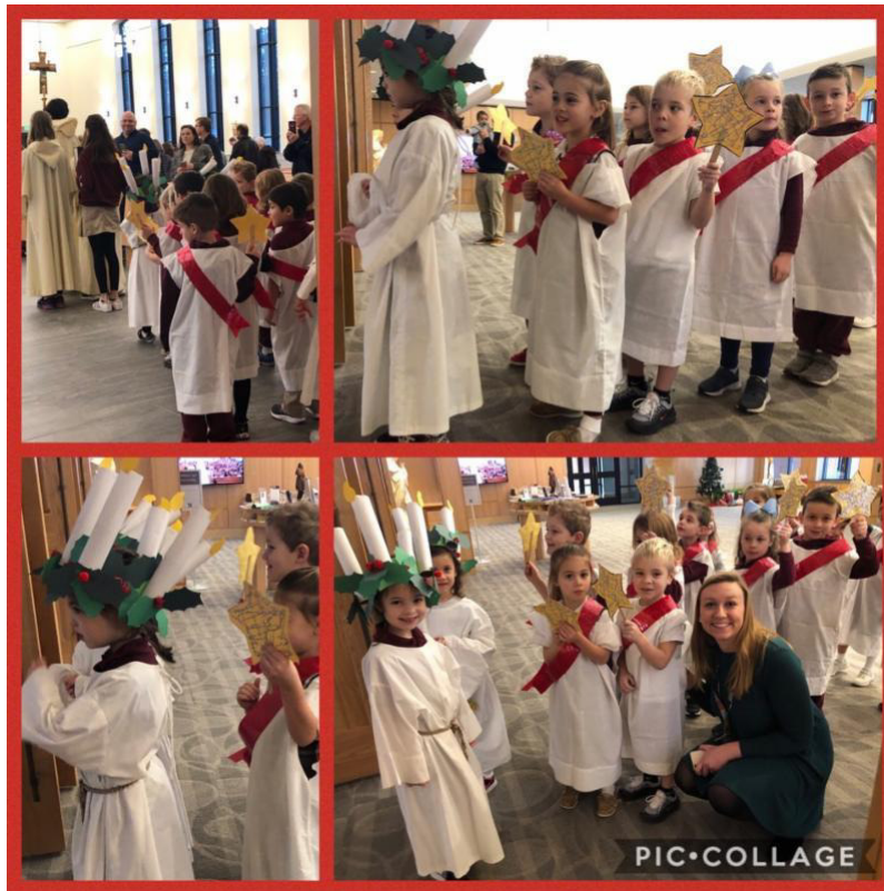
St. Lucy's Day procession