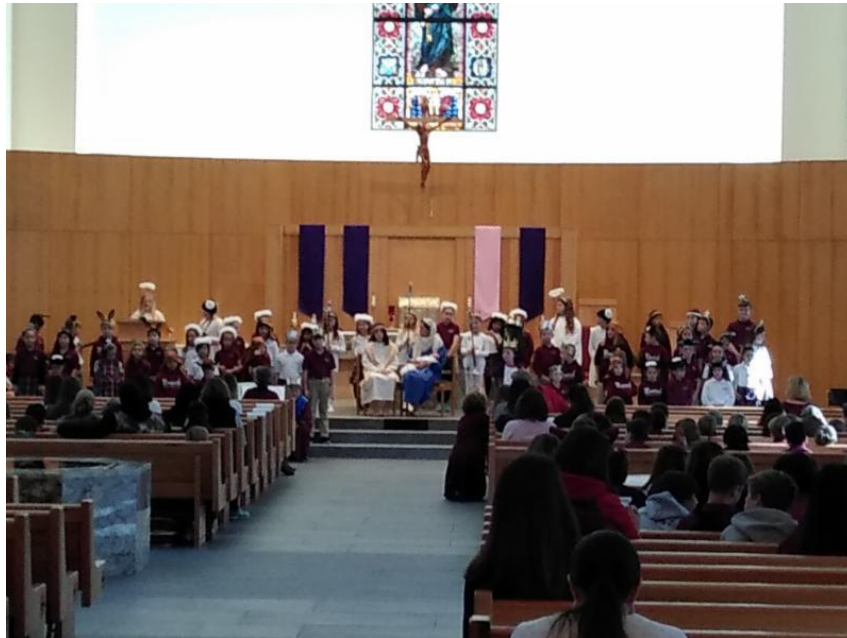
StMM School Christmas Pageant this week.