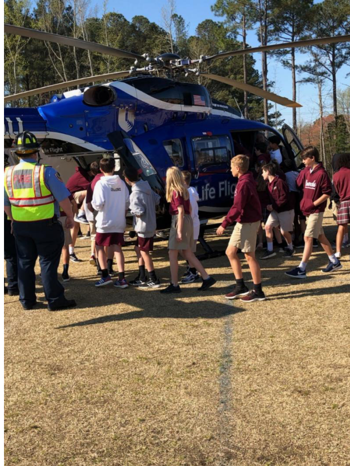
Duke Life Flight - a visit to our school students