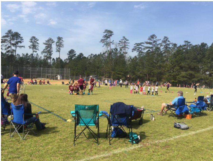
Parish Athletics soccer games