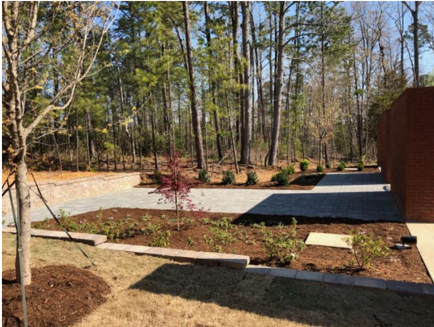
Garden for children - a work in progress