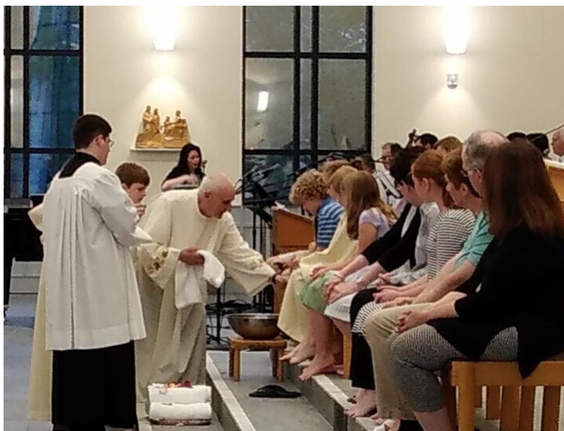
Holy Thursday - washing of feet