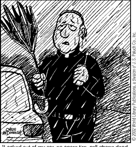
"Locked out of my car, no spare tire, cell phone dead, and in between the thunder I can hear Job laughing."